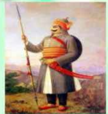
Maharana Pratap Singh

Throughout his life, Maharana Pratap engaged in several battles, fiercely defending Mewar. His qualities of bravery, honesty, and a commitment to protecting his kingdom earned him renown. He set an example of valor in his lifetime, and his legacy continues to be remembered as that of a great warrior in Indian history.