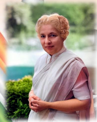
Vijaya Lakshmi Pandit

She served as a governor of the state of Maharashtra from 1962 to 1964, and from 1964 to 1968 she was a member of the Indian Lok Sabha (parliament), representing the constituency formerly represented by Jawaharlal Nehru. In 1977 Pandit left the Congress Party to join the Congress for Democracy, which had merged with the Janata Party. A year later she was appointed as an Indian representative to the UN Human Rights Commission, in 1979 she has published "The Scope of Happiness - A Personal Memoir". According to her "Difficulties, opposition, criticism-these things are meant to be overcome, and there is a special joy in facing them and in coming out on top. It is only when there is nothing but praise that life loses its charm and I begin to wonder what I should do about it." Such an incredible personality left this world on 1st of December 1990